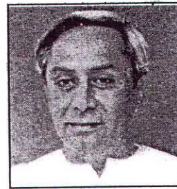
NAVEEN PATNAIK CHIEF MINISTER, ORISSA

I am happy to know that the Annual Report on Natural Calamities (2001-2002) prepared by the Special Relief Commissioner, is being published as a booklet by OSDMA. The document containing facts about loss and damage makes us aware of the enormous human suffering that disasters bring, to mitigate which we must make sustained efforts at prevention and preparedness. This Report also gives information on relief and response. I sincerely hope that wider dissemination of this Report would help raise public awareness on disasters and enable us to prepare better for future hazards. I thank both the Special Relief Commissioner, and OSDMA for having brought out this very useful document.